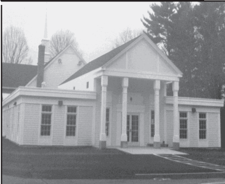
Faith Formation Center

Youth Programs; See inside bulletin 4th column